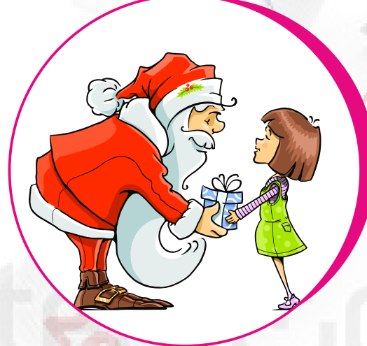
Happy New Year