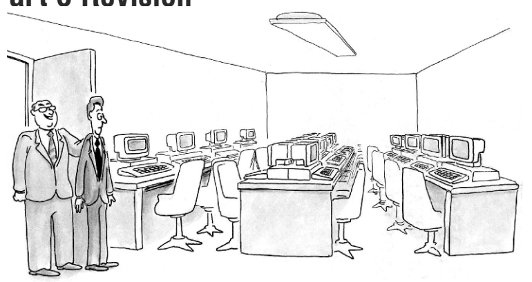
"Our Customer Support has everything but the human touch."